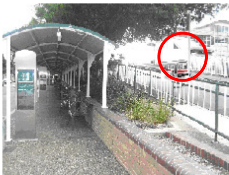
Sutherland (bus stand on down ramp)

The revised mini-bus timetable will expire on 31 December 2010. – Please Note new location